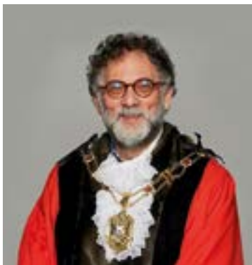
Craig Simmons Lord Mayor of Oxford

As the mayor of Oxford, Craig carries out over 300 engagements each year, ranging from high profile royal visits to smaller community work. As well as chairing the city council, Craig spends his time promoting Oxford, the council's initiatives, and supporting organisations based in Oxford.